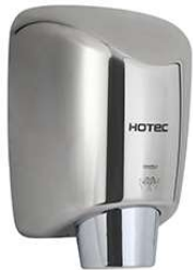
Reference: 11.253.B 304 stainless steel bright