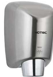
Reference: 11.253.S 304 stainless steel satin